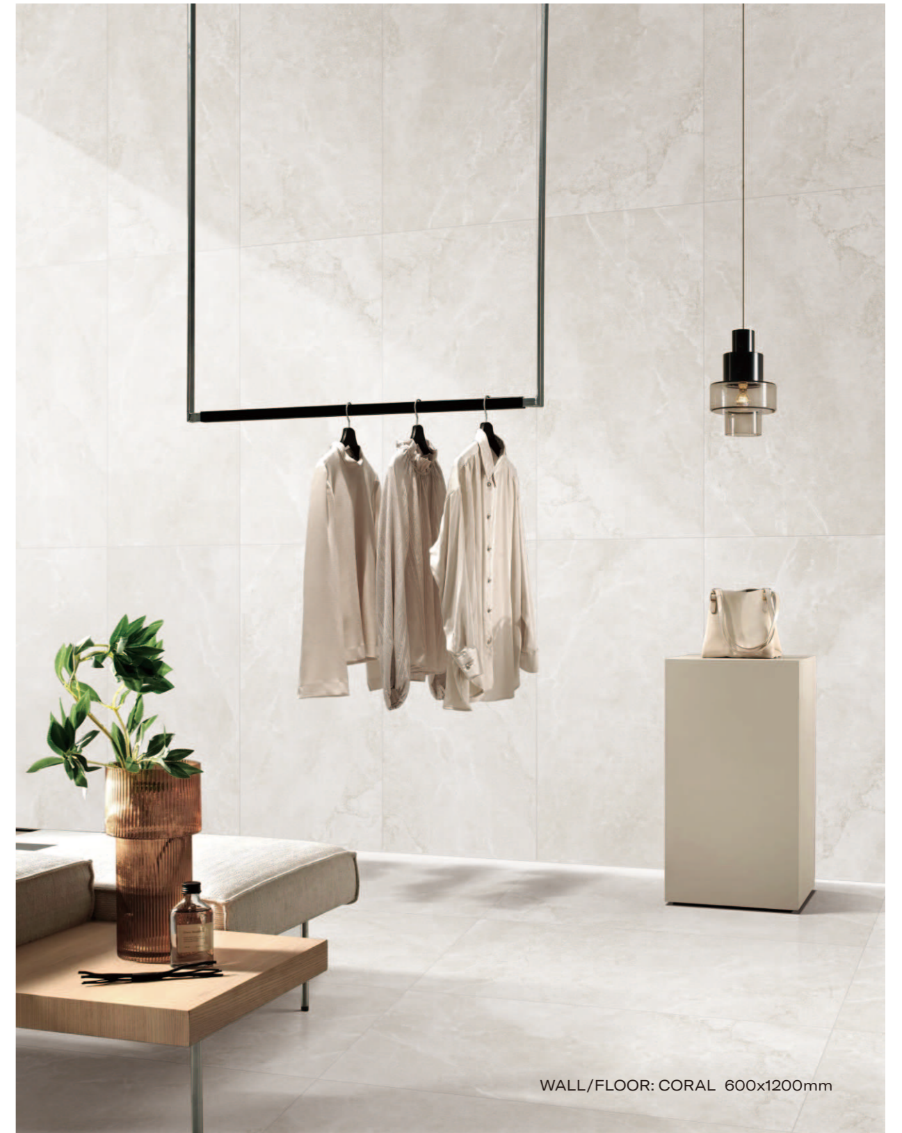
WALL/FLOOR: CORAL 600x1200mm