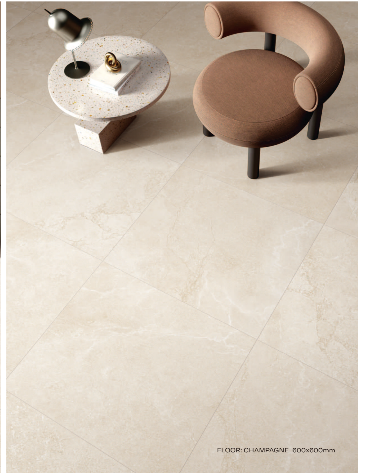
FLOOR: CHAMPAGNE 600x600mm