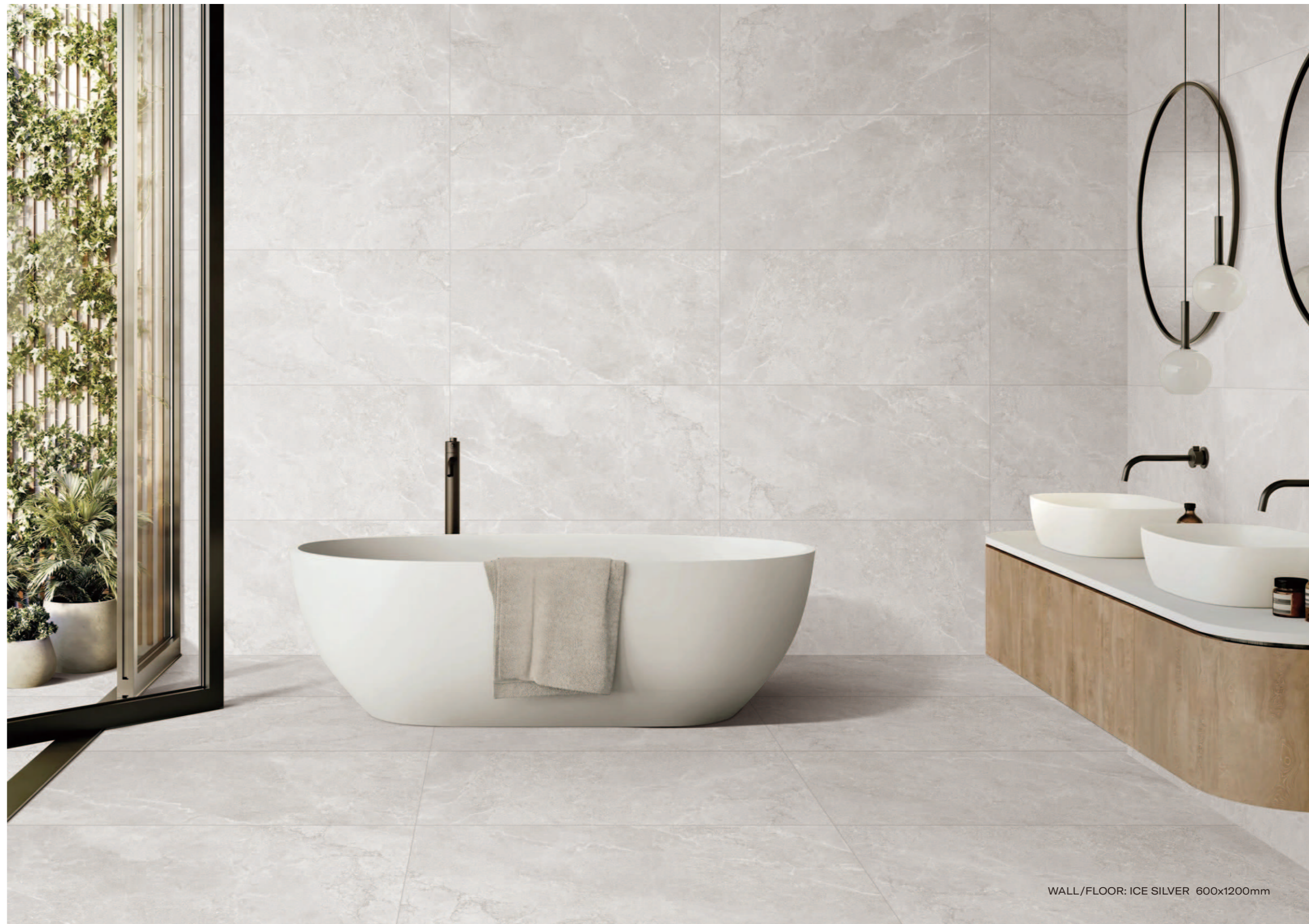
WALL/FLOOR: ICE SILVER 600x1200mm