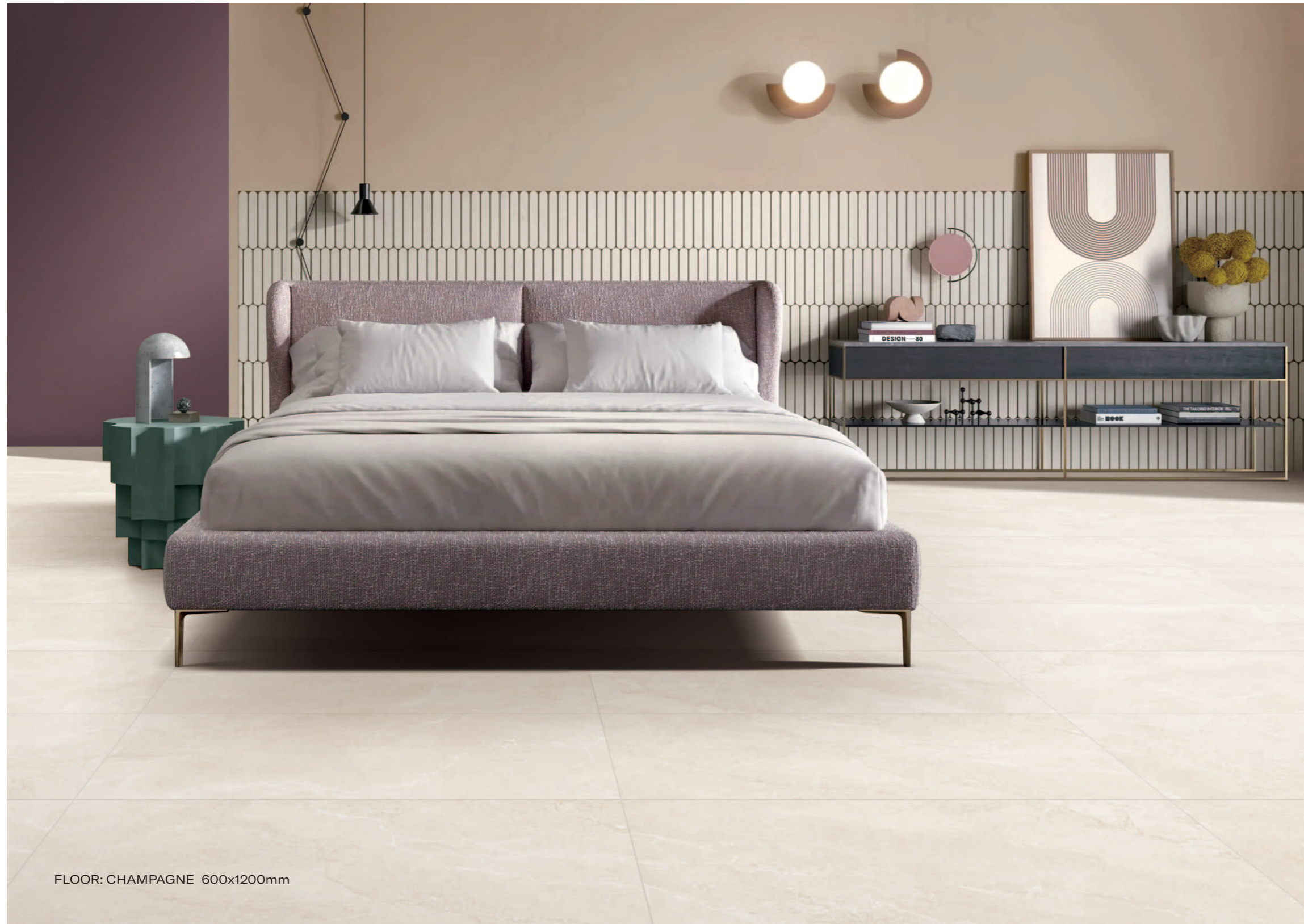
FLOOR: CHAMPAGNE 600x1200mm