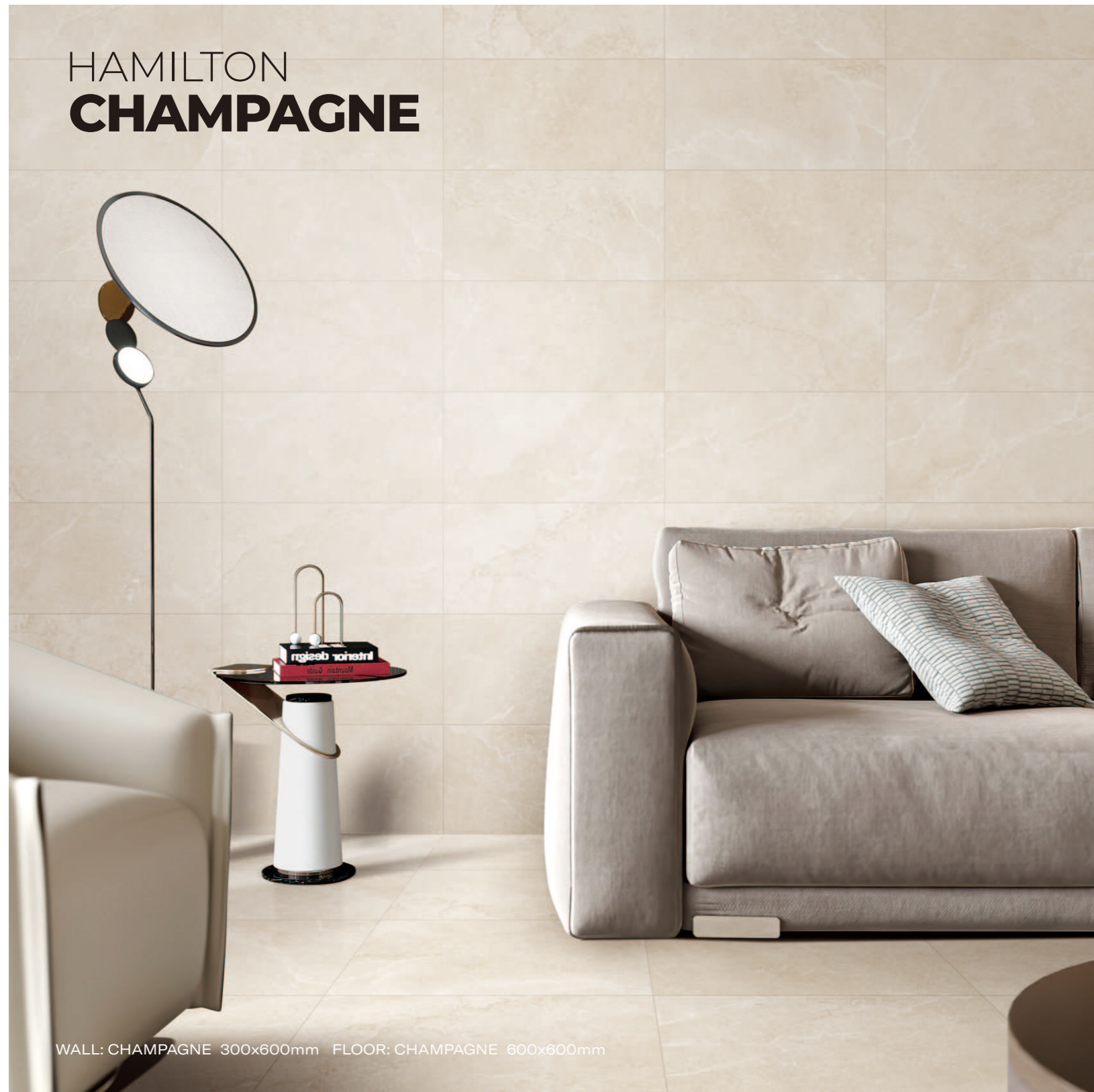
WALL: CHAMPAGNE 300x600mm FLOOR: CHAMPAGNE 600x600mm