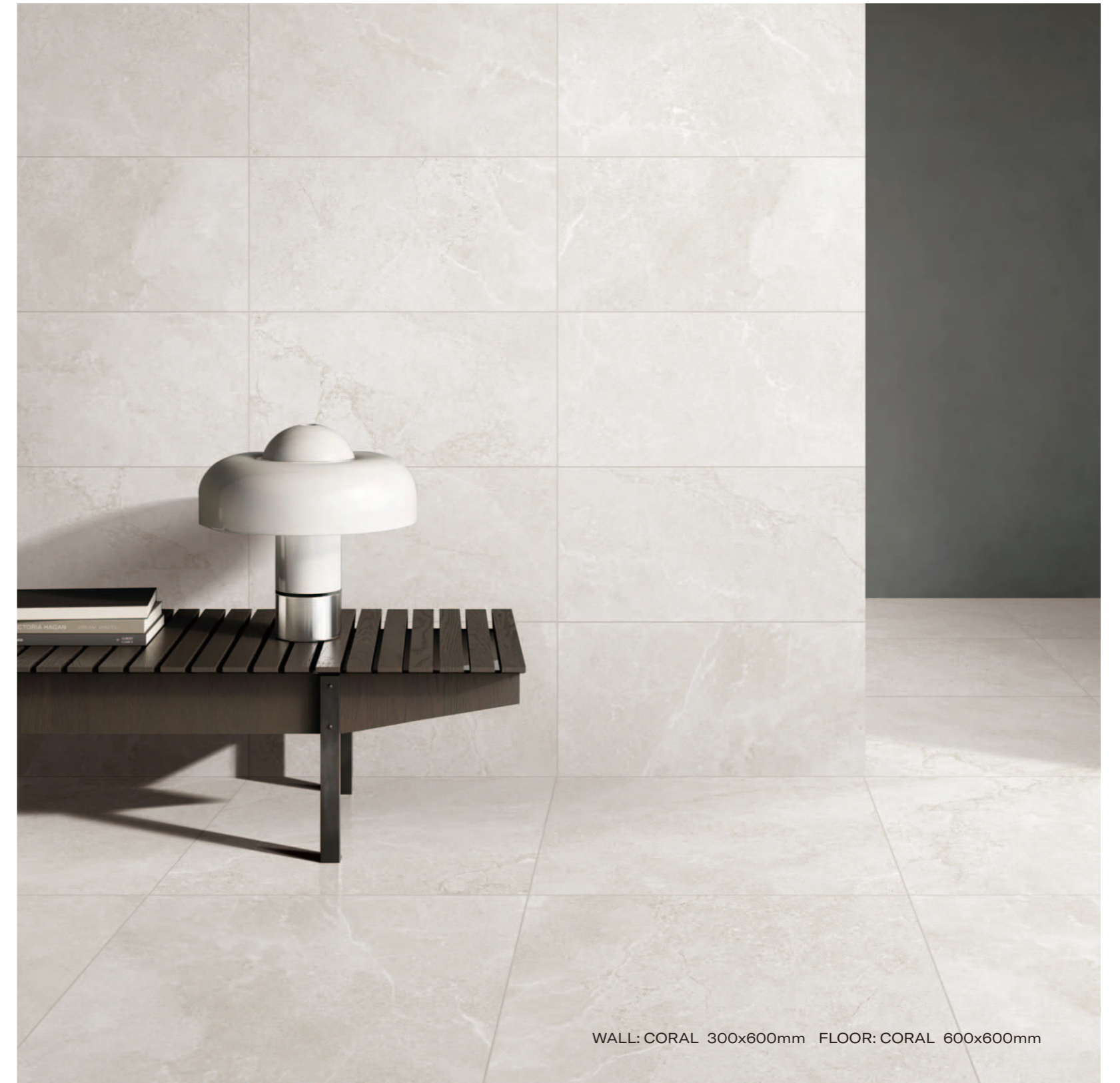
WALL: CORAL 300x600mm FLOOR: CORAL 600x600mm