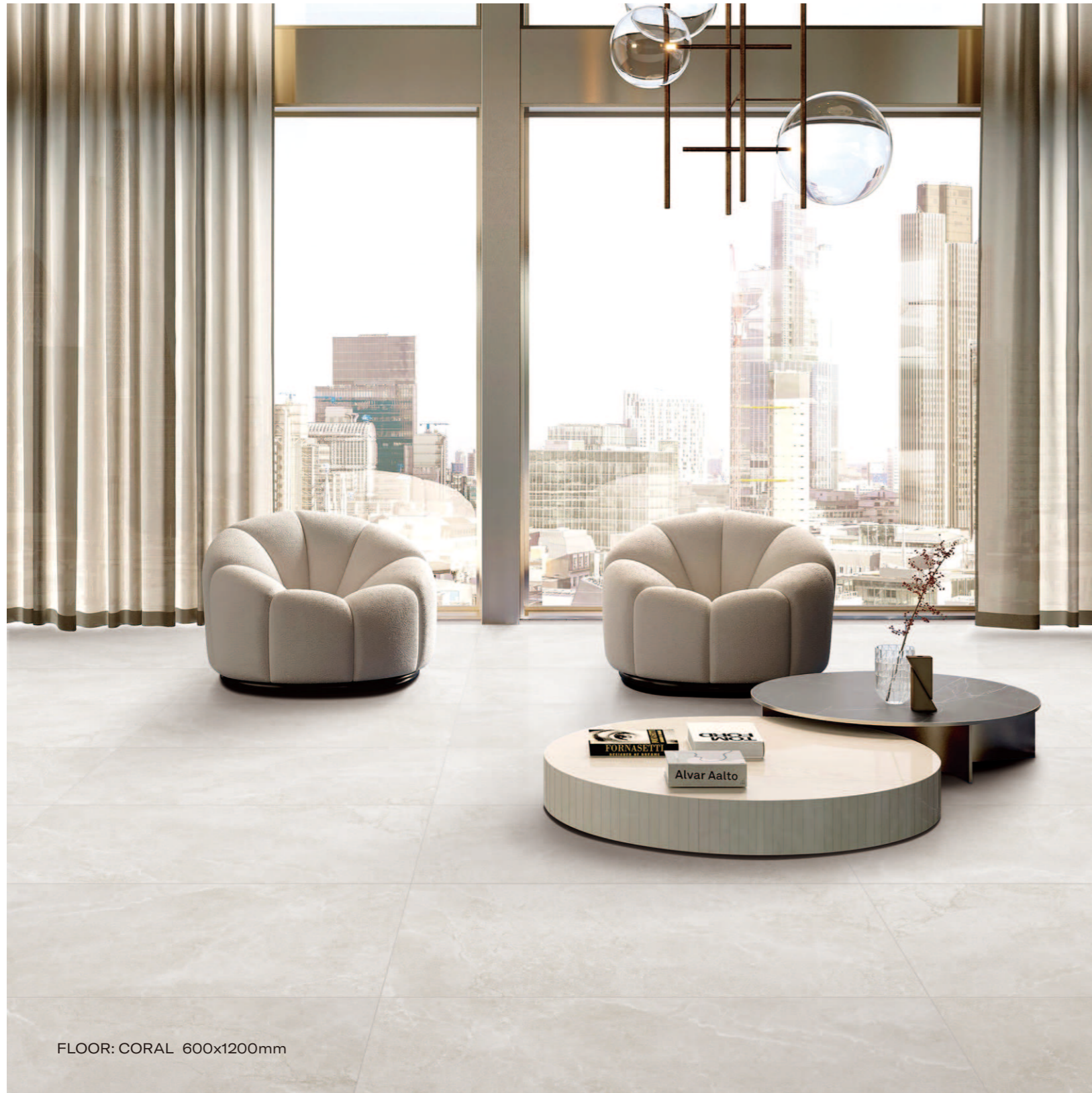
FLOOR: CORAL 600x1200mm