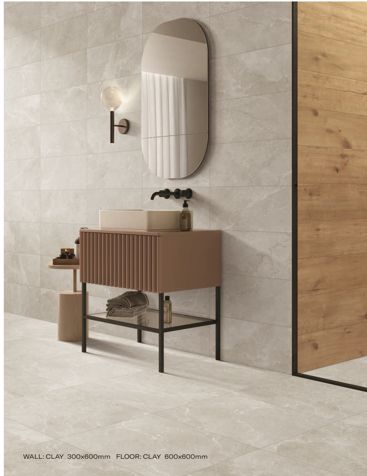
WALL: CLAY 300x600mm FLOOR: CLAY 600x600mm