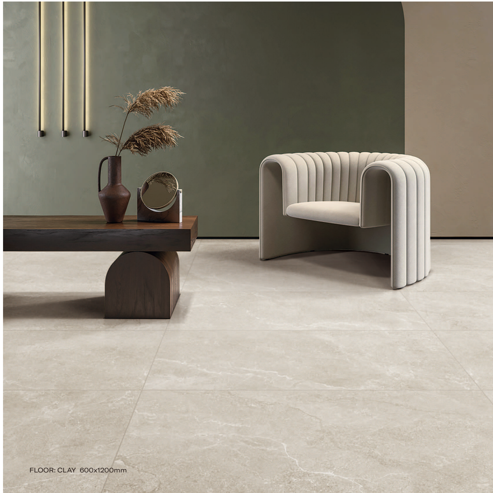
FLOOR: CLAY 600x1200mm