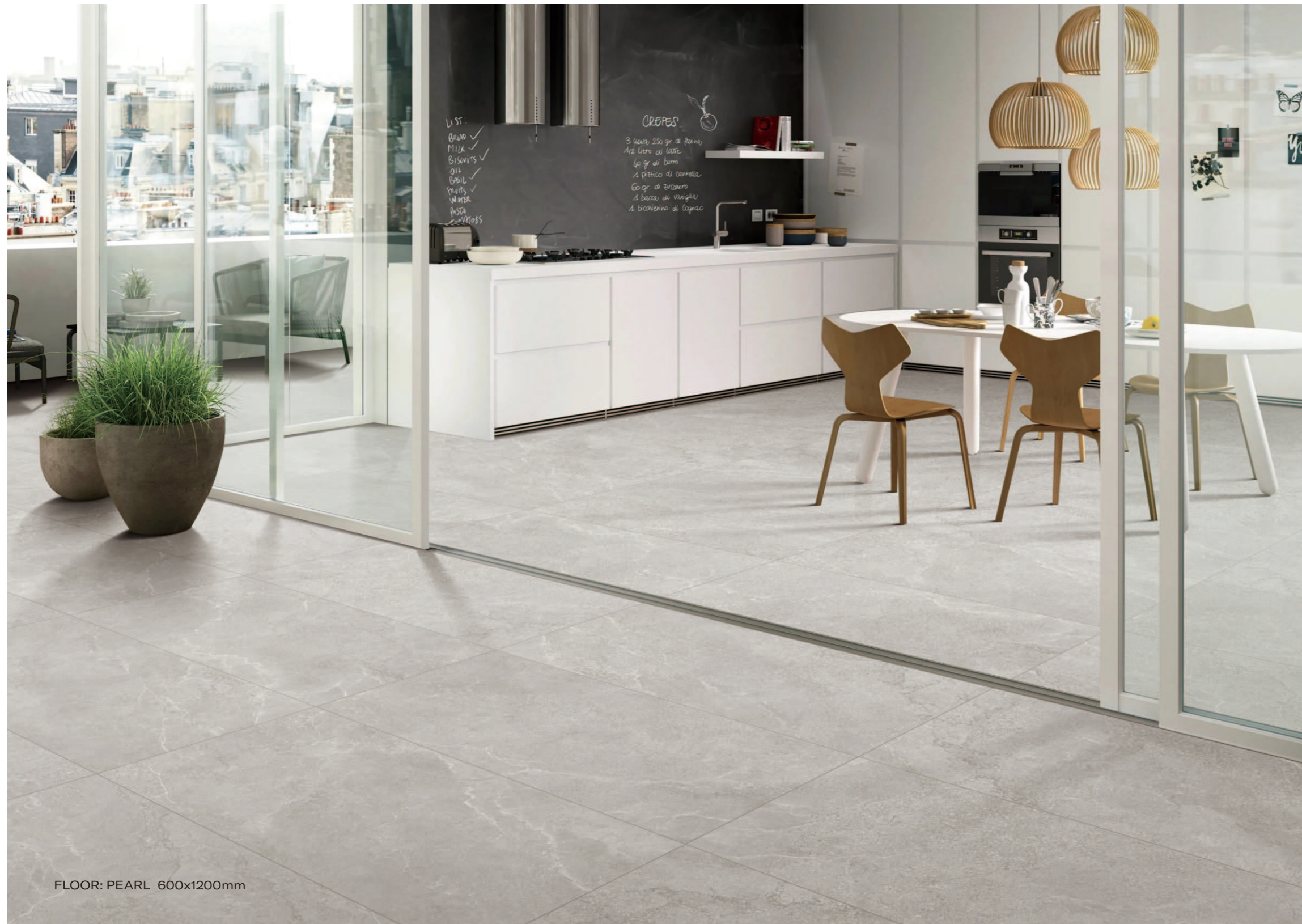
FLOOR: PEARL 600x1200mm