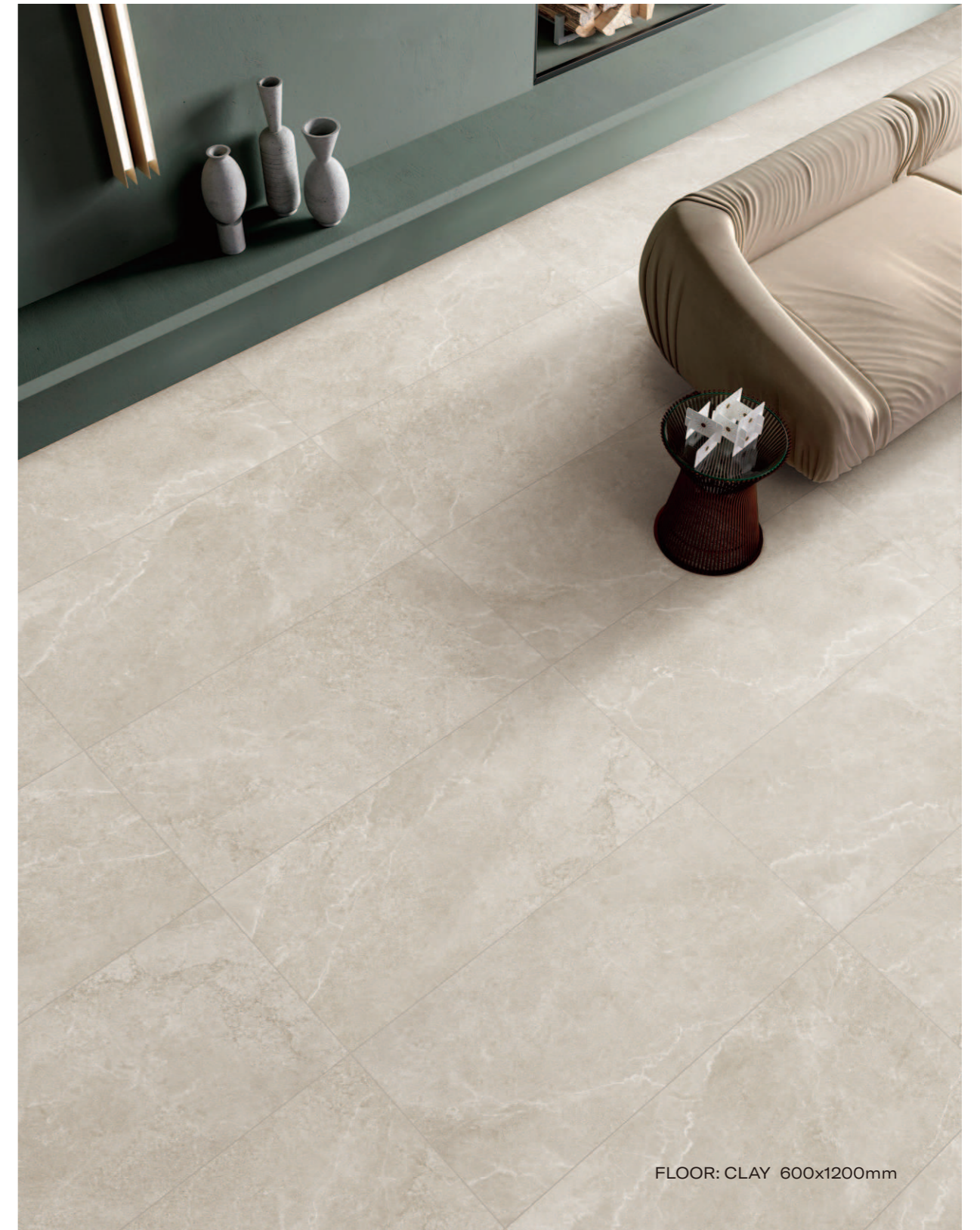
FLOOR: CLAY 600x1200mm