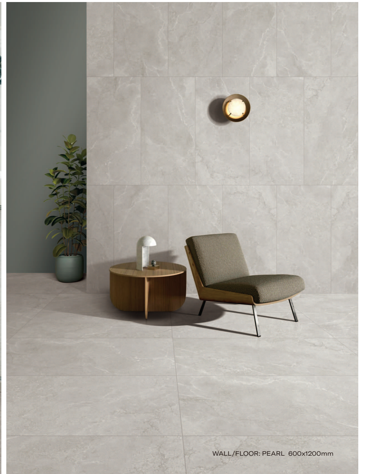
WALL/FLOOR: PEARL 600x1200mm