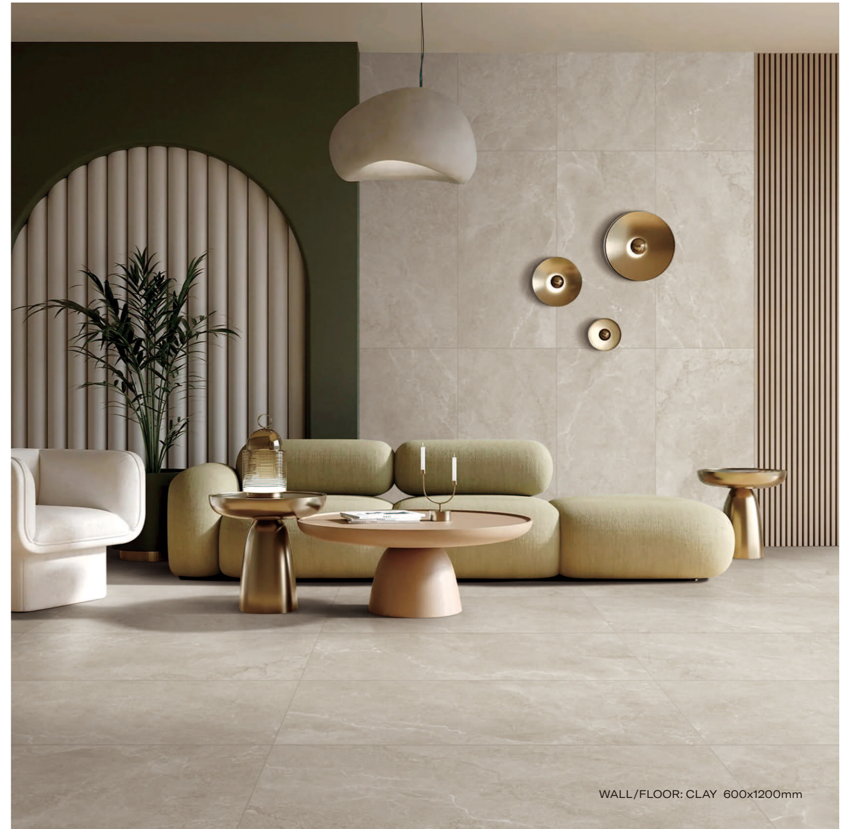
WALL/FLOOR: CLAY 600x1200mm