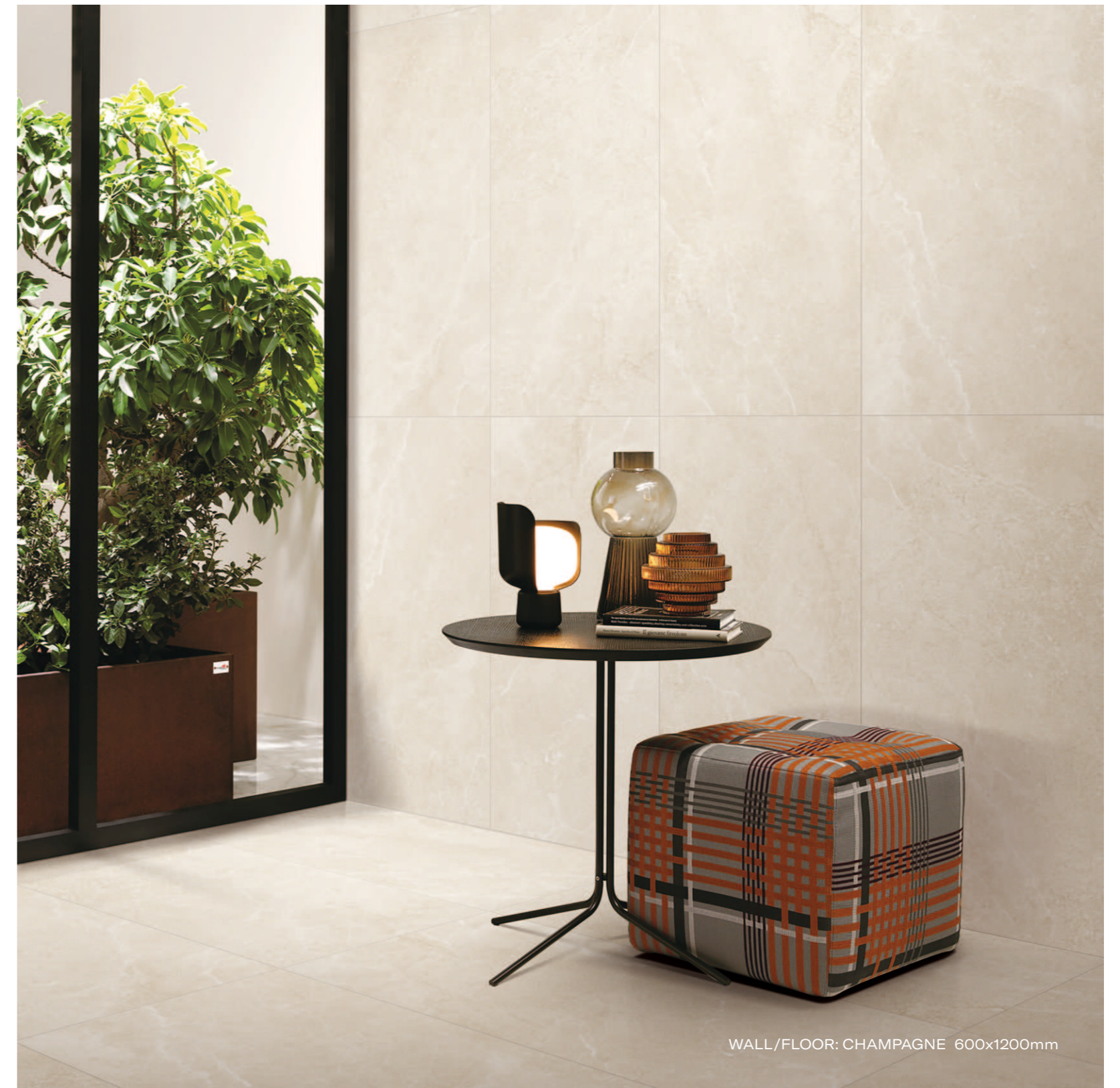
WALL/FLOOR: CHAMPAGNE 600x1200mm